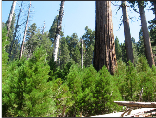
Figure 3. Giant sequoia regeneration in a wildfire stand of the Redwood Mountain grove, Giant Sequoia National Monument, California. Photo was taken approximately 23 years post-fire.

significant for Case Mountain) and soil moisture (Redwood Mountain). For wildfire stands of the Case Mountain grove, the reduced logistic regression model correctly classified 94% and 56% of giant sequoia small seedling pres-